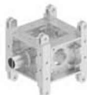
TT4-11-LOWER SAFETY BLOCK