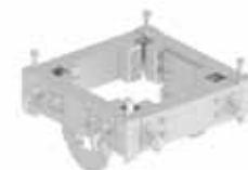
TT4-12-UPPER SAFETY BLOCK